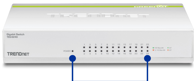
1 LED Indicators