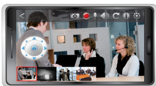
Free App with Remote Pan/Tilt