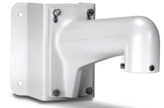
Corner Mount TV-HN400