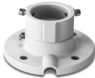
Ceiling Mount TV-HC400