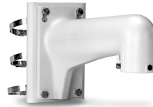
Pole Mount TV-HP400