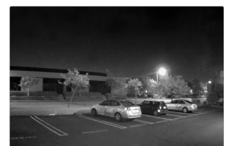
30 M Night Vision