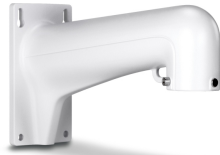
Wall Mount TV-HW400