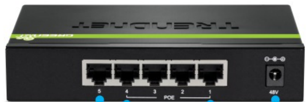
1 x Gigabit port