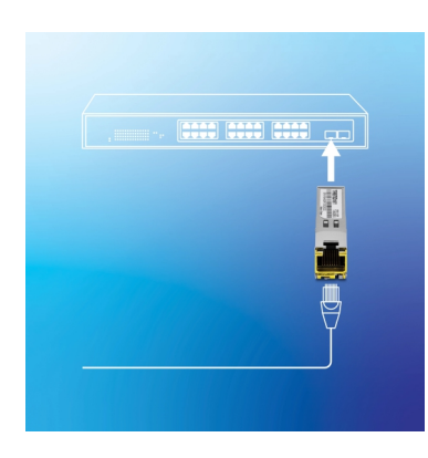
RJ45 Copper SFP Take advantage of unused SFP ports and repurpose them for RJ45 copper gigabit connectivity.