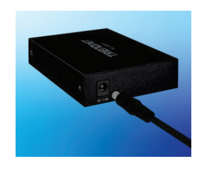
Power Adapter A power adapter is included with the 10G SFP+ transceiver for standalone use.