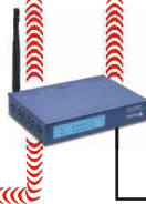
Cable/DSL 54Mbps 802.11g Wireless Router (TEW-431BRP)