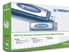
New Wireless Packaging with Window