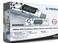
World Cup Limited Edition