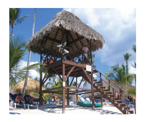
Networks People Trust<sup>™</sup>

The crowded beaches stretch out over 16 kilometers or 10 miles and experience extreme climate changes; daily temperatures fluctuate greatly, severe storms are common, hurricanes strike every few years, and the ever present Trade Winds stir up sand and dust.