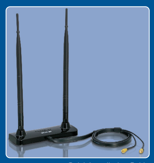
Quick Installation Guide