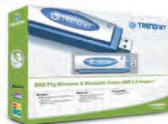
New Wireless Packaging with Window