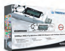
World Cup Limited Edition