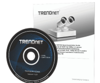
CD and Quick Installation Guide