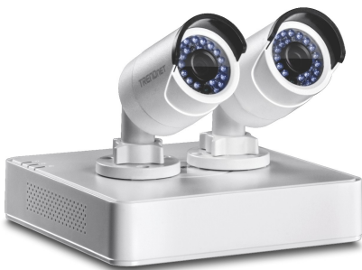
TV-NVR104 2 x TV-IP320PI