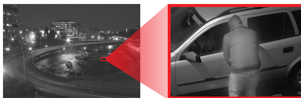
20x optical zoom, 16x digital zoom, and autofocus