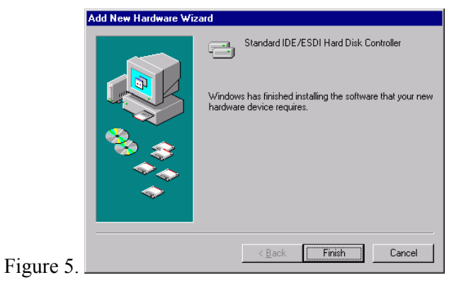
- 7 -