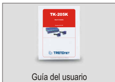
Guía del usuario

El conmutador TK-205KR de 2 puertos PS/2 KVM es compatible prácticamente con todos los PCs y sistemas operativos. Sólo necesita un monitor, un teclado PS/2 y un ratón PS/2.