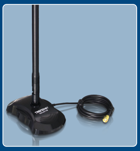
Quick Installation Guide